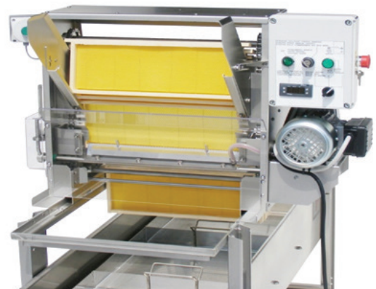
Semi - Automatic Uncapping Machine

WHERE CAN I GET MORE INFORMATION ON THIS SERVICE Ministry of Agriculture