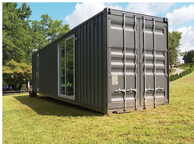
Honey Harvesting House Portable Type